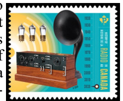
History of Radio in Canada, 05/20/2020

techno out of the playlists to please advertisers, and they put it back in. Sadly, the fabulous experiment ended in August of 1992 when they changed to a more commercially viable format. You guessed it, “smooth jazz!”