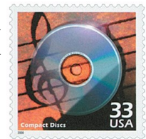
Compact Discs, Celebrate the Century – 1980s, 01/12/2000

It was the first station ever to feature techno, house, and rave (or “electronic and alternative” format) in regular rotation along with new rock and party jams. 24/7 dance music! They would play comments from listeners between cuts. My favorite listener request was, I’d like to hear something GAY!” Listeners called in to protest when they slipped the