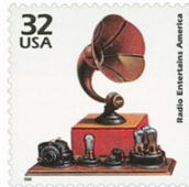
Radio Entertains America, 05/28/1998